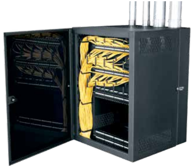
shown with optional offset rackrail